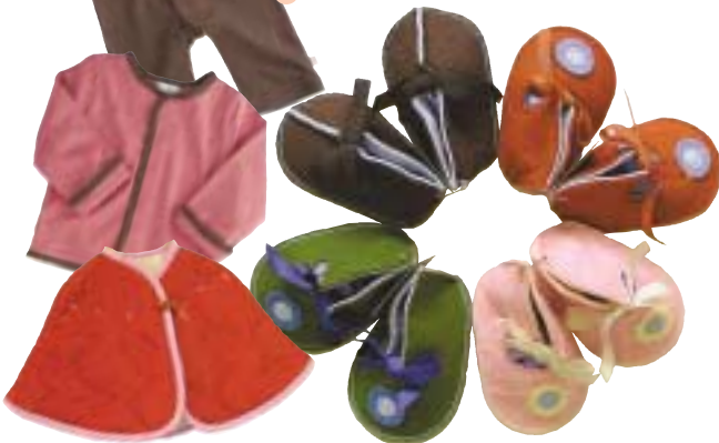
Babysoy soybean fiber one-piece, soybean fiber year-round cardigan, cc3 Designs quilted flower poncho, and Little Deer handmade shoes.

Just type "AUDREYMAG" at checkout! Expires July 31, 2006.